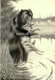
MUSKWA HAD A'TIM IN HIS LONG- CLAWED GRASP.

scarcity, and the hunters may bring us evil."