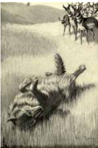
"LYING ON MY BACK AS THOUGH

"Well, it was this way: Once upon a time, in the low hills they call Cypress, I was stalking a herd of antelope. To tell you the truth, I had been at it for two days. Waugh! but they were wary. At last I worked within fair eyesight of them, and knowing the stupid desire they have to look close at anything that may be strange to them, I took to myself a clever plan. Lying on my back as though I were dead, I held my tail straight up, and let the wind blow it back and forth. The big-eyed Eaters-of-Grass asked one another: 'What is this new thing? Is it a plant or an animal?' That is the way they talked, I am sure, for they are like