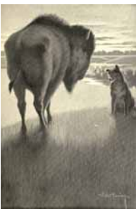
"I AM NO WOLF, SHAG. I AM A'TIM

"Even so, Brother," said Shag, "how comes it that thou art a half-breed Wolf at all?"